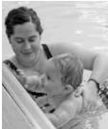
Baby and Me classes

There are great programs, from Arthritis classes to Baby and Me classes scheduled at the pool – drop in and take a swim!